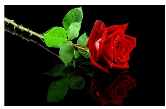
Join us for a