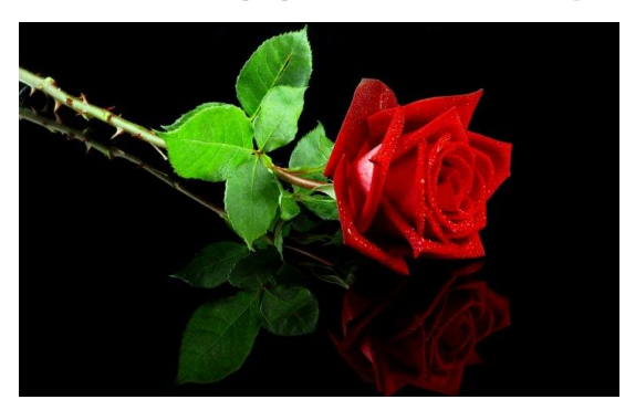
Join us for a