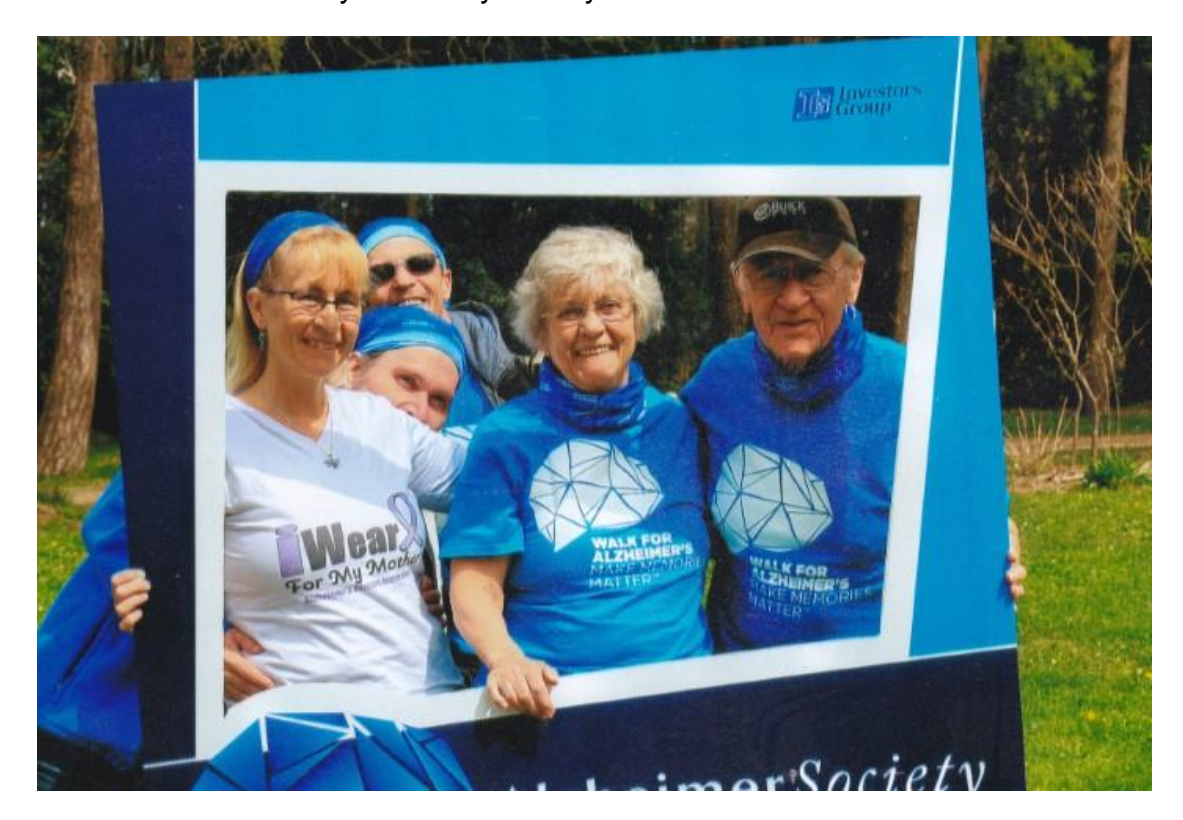
Art & family.

Funds I raise are invested in support of programs and services that help people with dementia in our community! Thank you very much!!