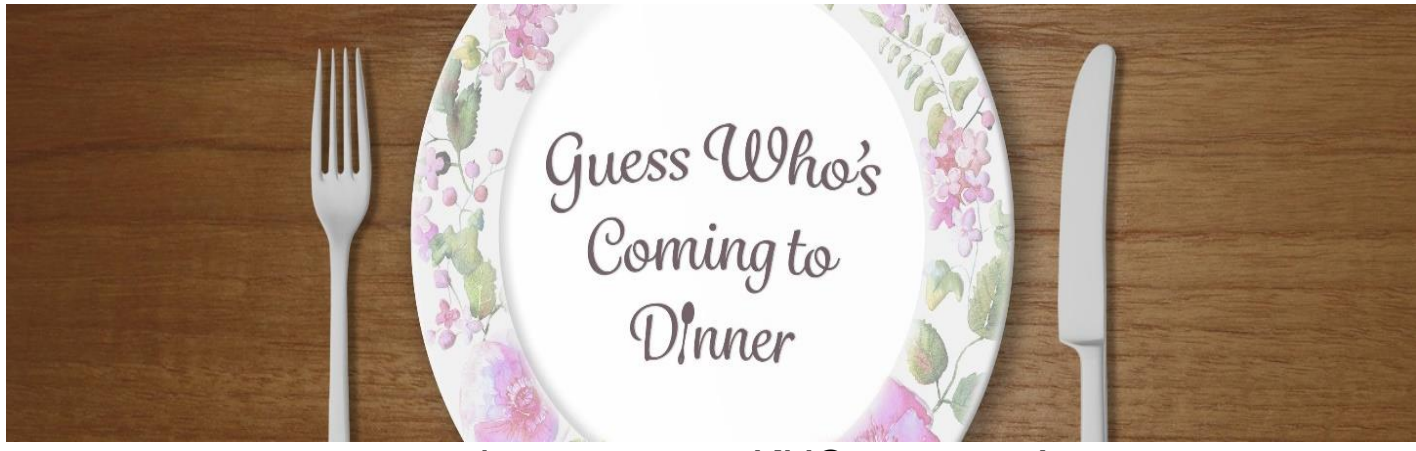
..coming soon to a KUC near you! Think about whether you would like to have fun being a host and/or a guest. More info soon.